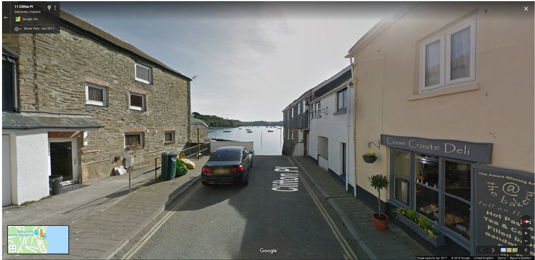
Photograph from Google Street View. Black vehicle is parked in location of proposed taxi stand.