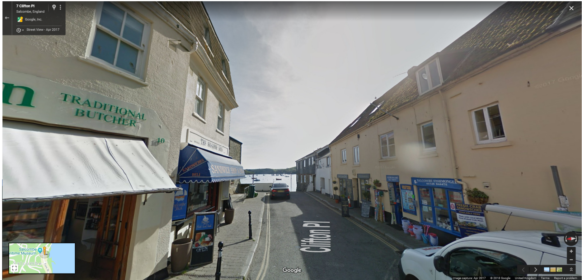
Photograph from Google Street View. Black vehicle in distance is parked in location of proposed taxi stand.