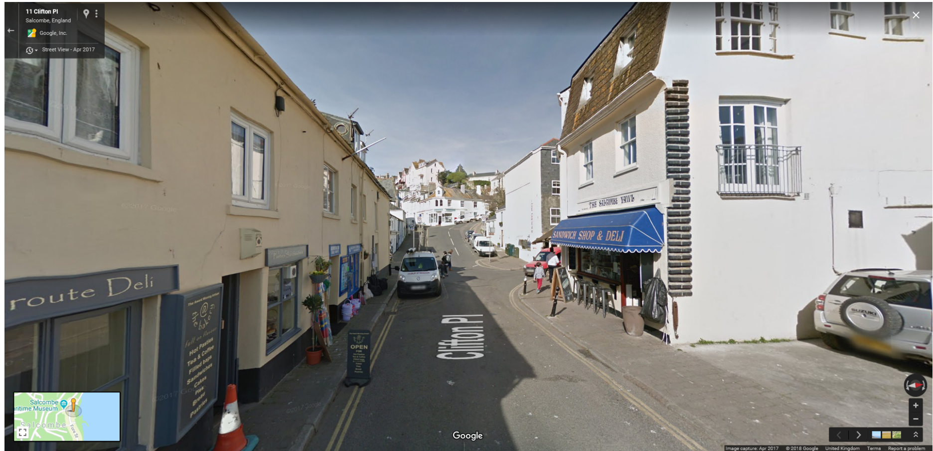
Photograph from Google Street View. View from proposed rank west along Clifton Place.